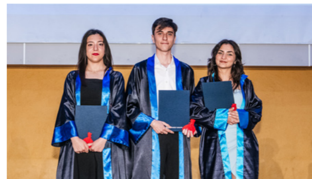
Sakıp Sabancı Secondary School Awards Ceremony