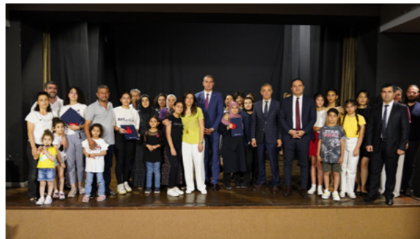
Dilek Sabancı Vocational and Technical Anatolian High School Awards Ceremony