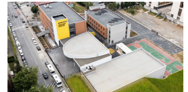
Enerjisa İstanbul Vocational and Technical Antolian High School