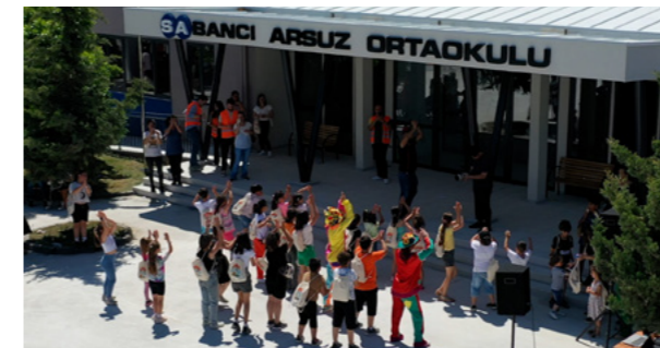
Sabancı Arsuz Secondary School, Hatay