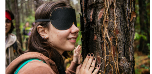
Participatory and Safe Youth Activism