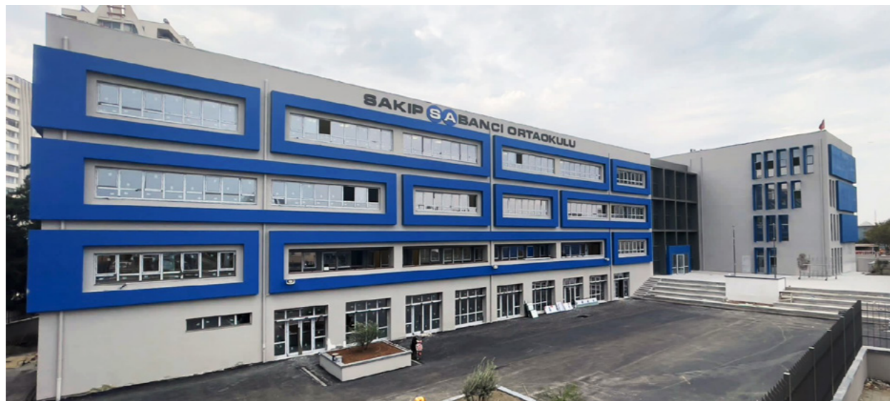
Sakıp Sabancı Secondary School in Adana was reconstructed in 2023 and handed on to the Ministry of National Education in the beginning of 2024.

Sabancı Secondary School Annex Building, Kocaeli