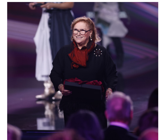
European Sustainability Award, 9 December 2023, Berlin