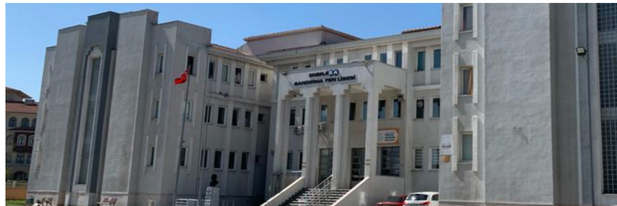
Enerjisa Bandırma High School, Balıkesir