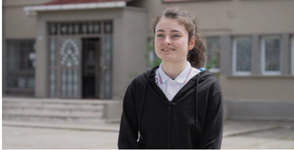
We Are in School, Too!