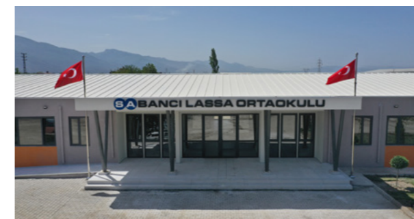
Sabancı Lassa Secondary School, Hatay