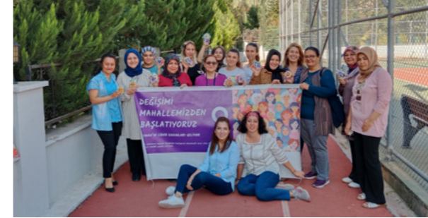
Change Starts in Our Neighborhood