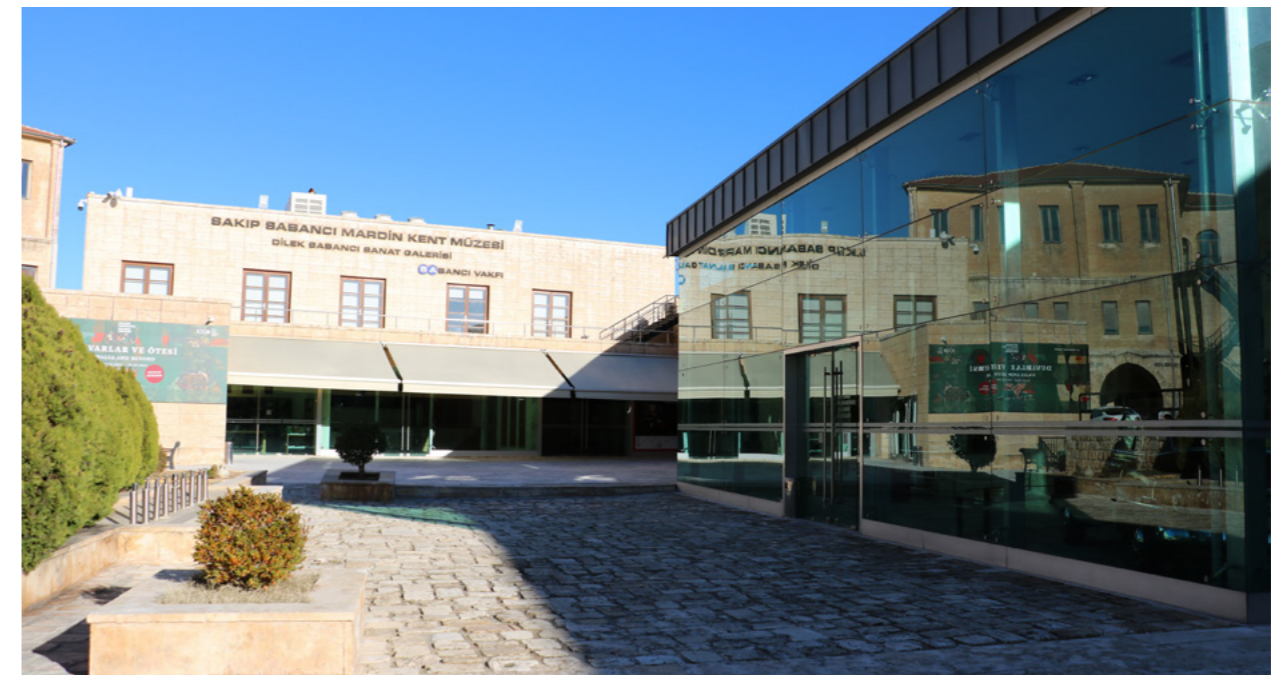
Sakıp Sabancı Mardin City Museum and Dilek Sabancı Art Gallery

The "Walls and Beyond" exhibition was opened on December 9, 2022, at Dilek Sabancı Art Gallery and continued in 2023. Being the 11th exhibition to be hosted by Dilek Sabancı Art Gallery the exhibition intertwines the ages-old human instinct to decorate walls with the oldest form of weaving and brings together over a hundred wall-hanging rugs from various collections.