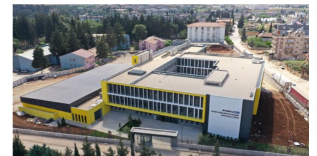
Enerjisa Hatay Vocational and Technical Antolian High School